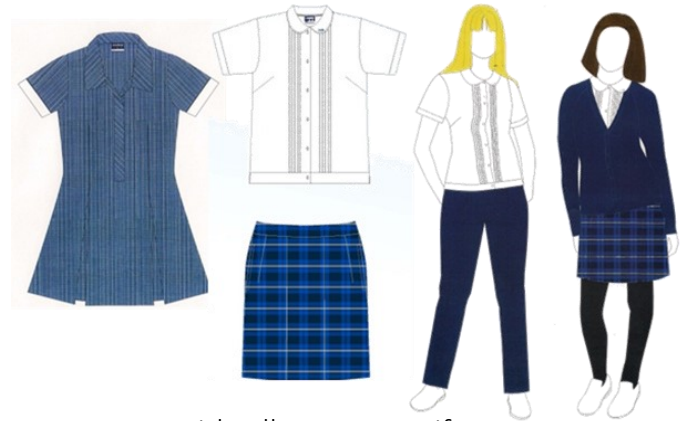
Girls All Seasons Uniform

Undershirts - students are not permitted to