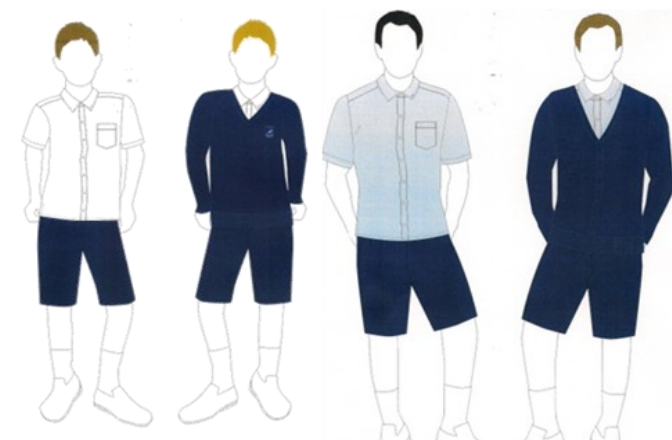
Boys All Seasons uniform

Shoes are to be black, fully enclosed leather/suede. Hoodies are unacceptable and are never to be worn under school jackets. If your child is wearing a hoodie they will be asked to remove it and this item will be confiscated and returned to them at the end of the school day.