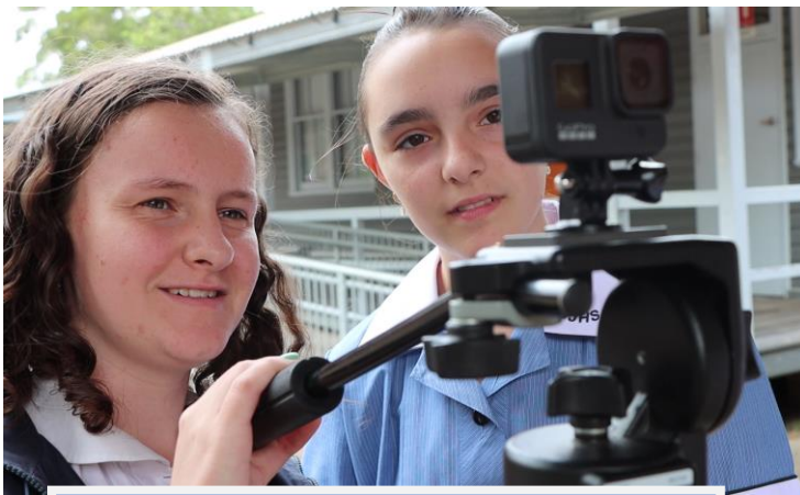
Industrial Technology Multimedia